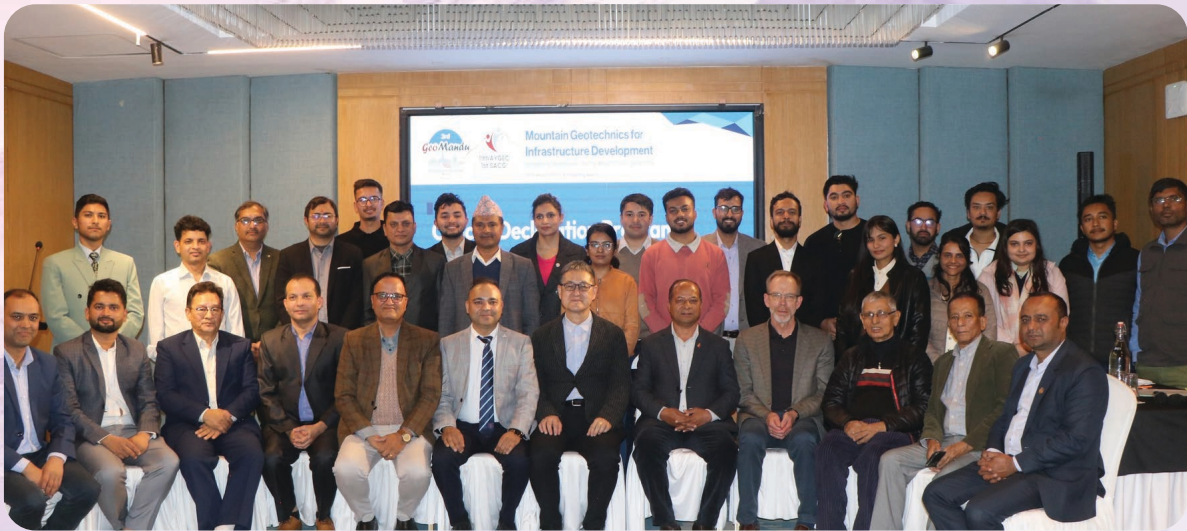
Official Deceleration Program of GeoMandu 2027

In recent years, civil engineering has increasingly emphasized sustainable, resilient, and environmentally conscious infrastructure, driven by rapid urbanization, climate change, and evolving global development priorities. Nepal reflects this global transition through significant achievements: expanding its road network from less than 10,000 km to nearly 45,000 km, advancing hydropower generation capacity toward national targets of 25,000 MW, and accelerating progress in road tunnels, rail connectivity, irrigation systems, water supply projects, and modern urban development initiatives.