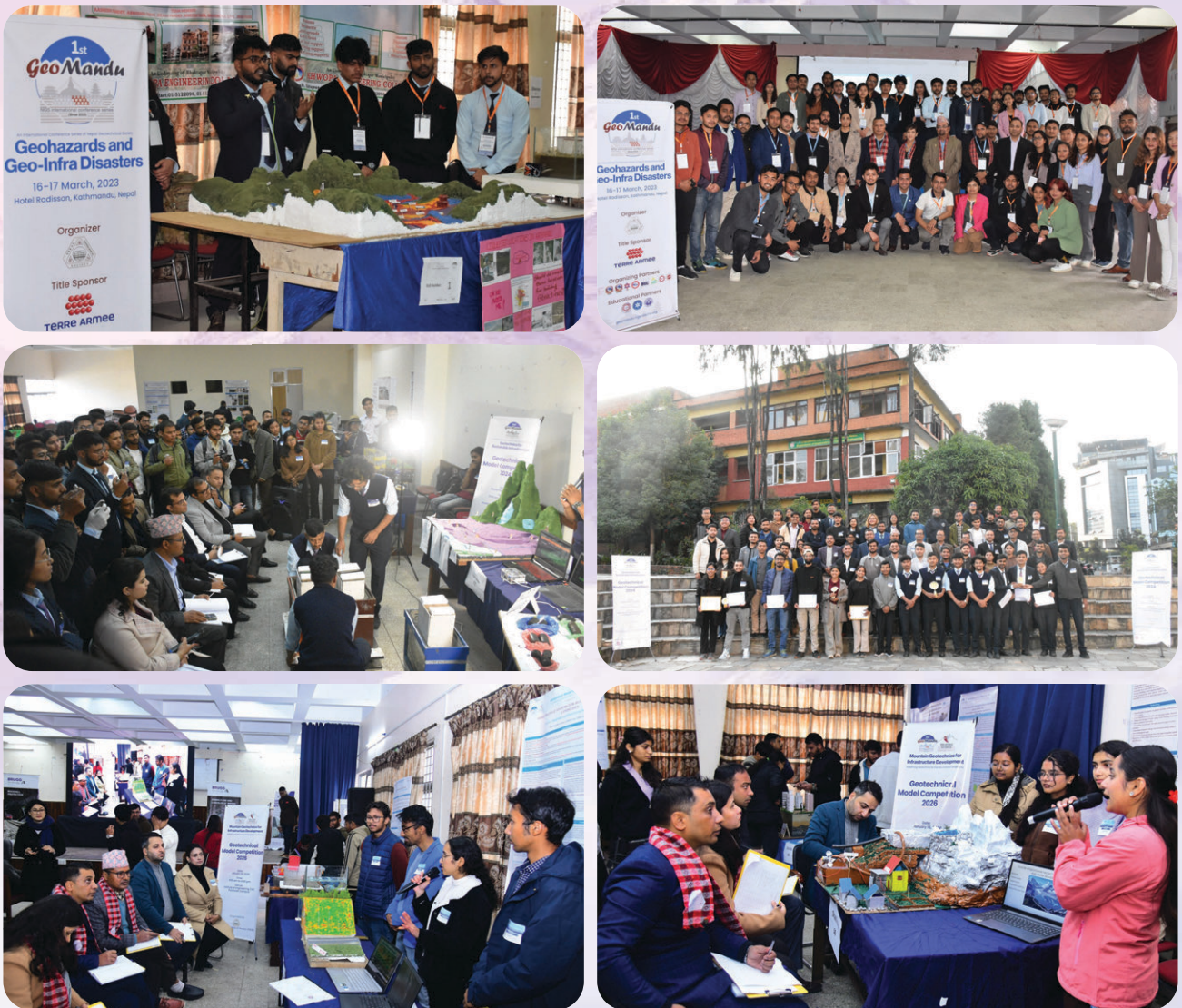
Photograph Highlights of Geotechnical Model Competition 2023, 2024 and 2026

Through physical and conceptual model demonstrations, students explore real-world geotechnical problems relevant to mountainous and geologically complex regions. The activity complements formal academic learning by providing a hands-on platform that encourages critical thinking and practical understanding of geotechnical challenges.