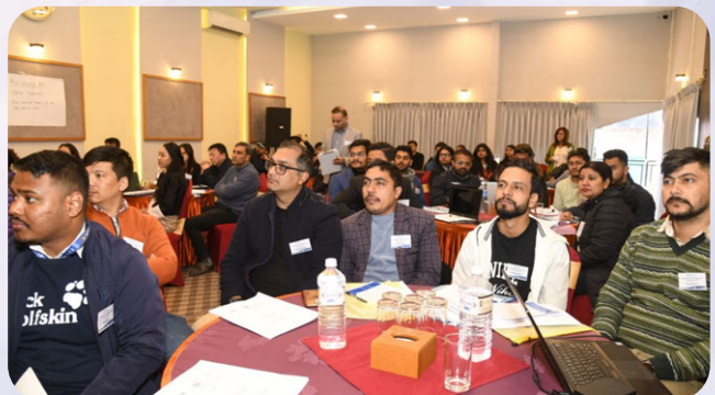
Photograph Highlights of Geohazard Risk Management Workshop 2024