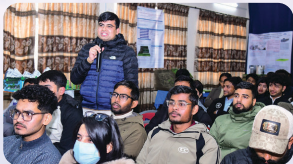
Photograph Highlights of NGS Youth Symposium 2026