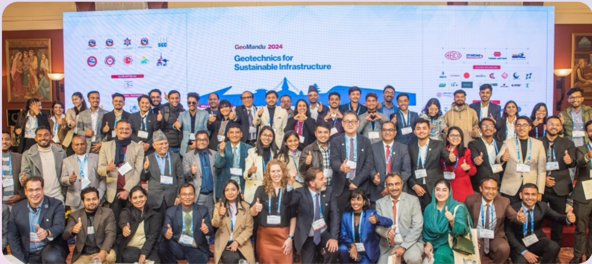
Group Photo of GeoMandu 2024

We extend our heartfelt invitation to join us in the scenic landscapes of Nepal as we collectively advance this important mission. Together, through “Mountain Geotechnics for Infrastructure Development,” we can contribute to building a safer, greener, and more resilient future for generations to come.