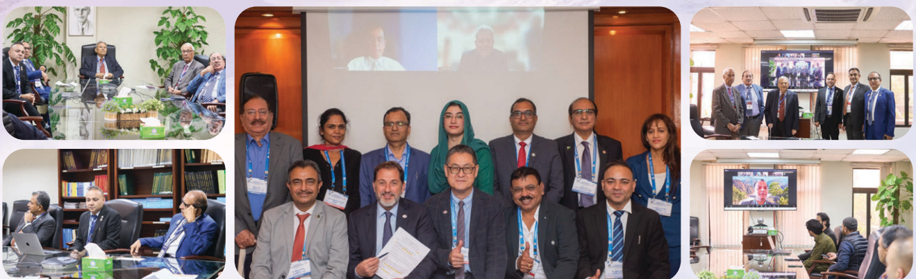
Photographs of AGSSA formation and AGSSA meeting at 17th ICGE and 8th ISG

A key milestone of AGSSA is the organization of the 1st South Asian Conference on Geotechnics (SACG) , to be held alongside GeoMandu 2027 , marking a significant step toward strengthening regional cooperation in geotechnical engineering.